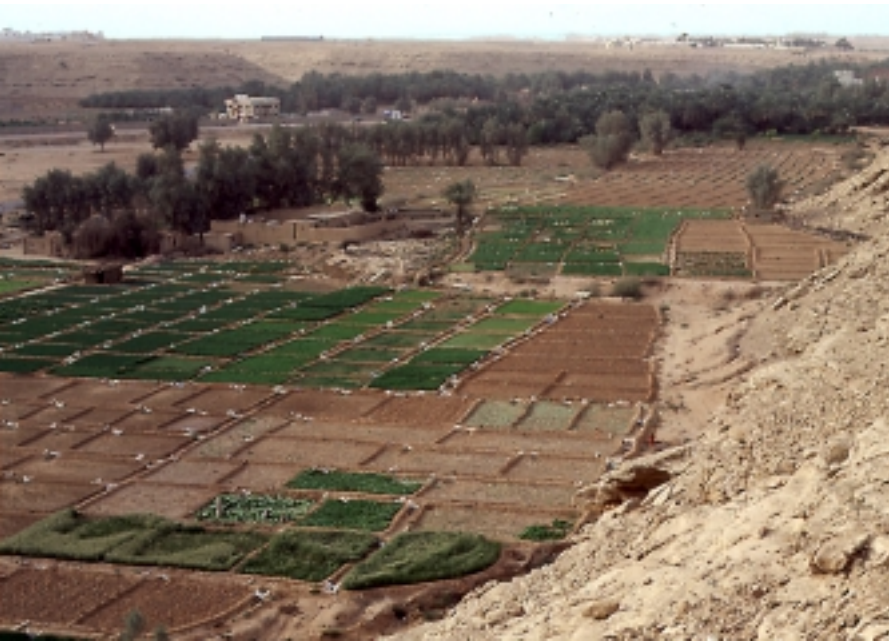
A RICHLY LANDSCAPED ENVIRONMENT SURROUNDS THE DIPLOMATIC QUARTER IN SAUDI ARABIA.

Oil wealth suddenly catapulted Saudi Arabia, known to the Romans as Arabia deserta , from centuries of being a Bedouin state with an archaic social structure, into the modern world. In a country where nature is considerably more sensitive than it is in Central Europe, rapid development brings with it the disadvantage of a progressive expansion of the desert. The palm tree and the colour green are a symbol of the state, and it is not surprising that trees and gardens are attributed a very different value to that which they have in Germany.