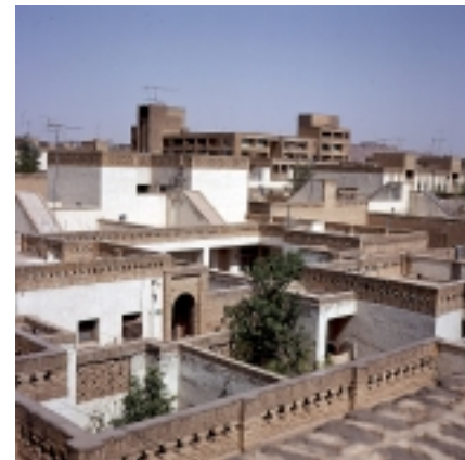
BELOW: SHUSHTAR NEW TOWN, KHUZESTAN, IRAN.