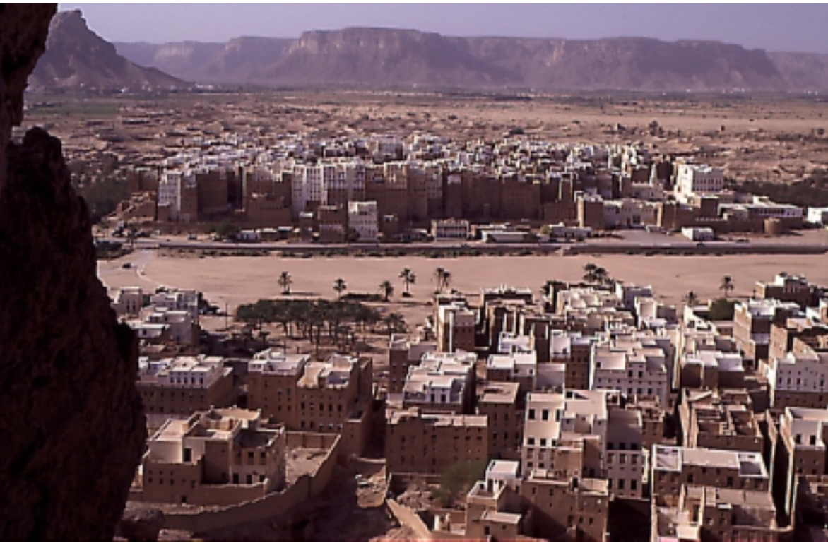
SHIBAM, YEMEN, WITH ITS MUD-BRICK SKYSCRAPERS, IS RAISED ON A MOUND IN THE MIDDLE OF WADI HADRAMUT.

In my garden, each member of the community of plants features most or all of these characteristic adaptations. A few are native to the area, but not all or even most. Many of them come from similar climate zones in other parts of the world. All of them seem at home in this setting. They use no chemical fertilisers or pesticides and little water. And they attract a great many birds and beneficial insects.