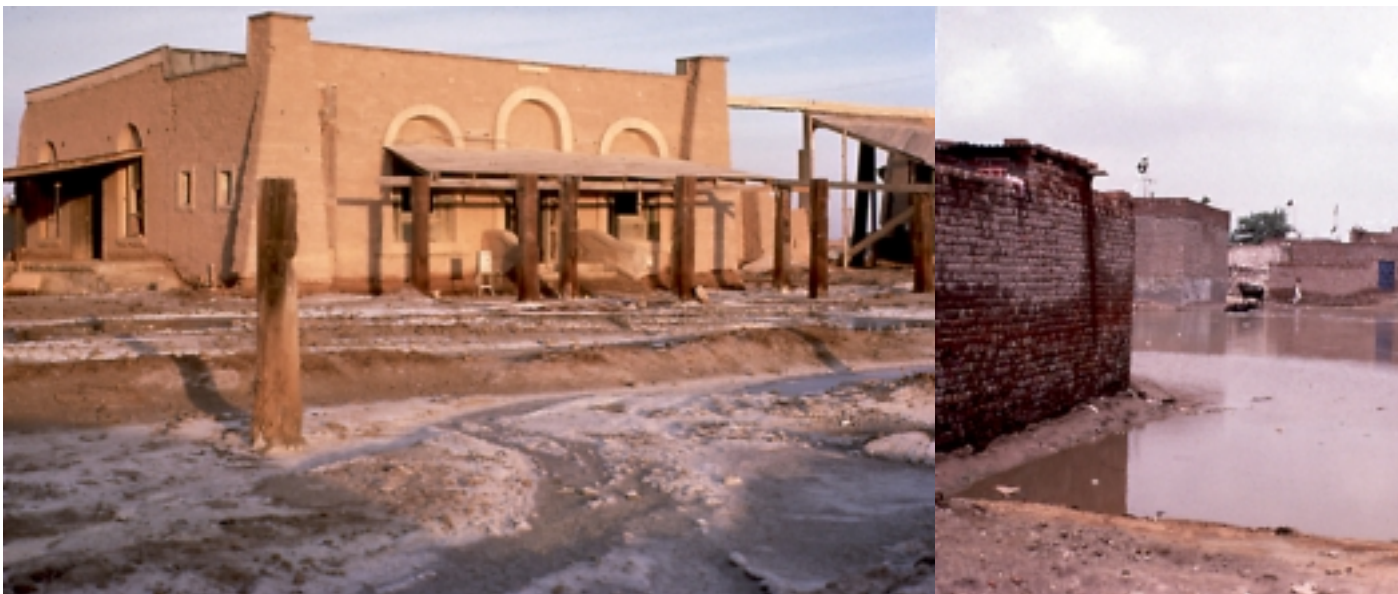
LEFT: WATERLOGGING AND SALINITY NEAR THE SALTON SEA, SOUTHERN CALIFORNIA, USA.