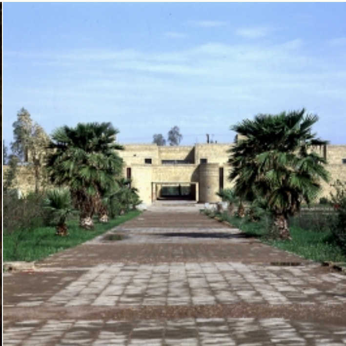
JONDI-SHAPOUR UNIVERSITY, ASHWAZ, IRAN . LEFT: AN EXAMPLE OF ARCHITECTURE AS A COMPONENT OF LANDSCAPE DESIGN. THE EXISTING WATER CHANNEL DICTATED THE SITE PLAN. RIGHT: THE PEDESTRIAN WALK INTERLOCKS OPEN SPACES TO THE MOSQUE COURTYARD.

of constructing a wall within which there is sufficient water, often supplied by means of a qanat , a non-mechanical method of bringing water from mountains and foothills to arid areas. Human resources can be focused on the creation of a concentrated universe of plant and animal life while ignoring the many hectares of land outside the walled garden. If any architecture is deemed necessary, it happens within this green universe. In other words, architecture is subservient to landscaping and comes into play as a design component in making the garden. This attitude is methodologically opposed to the current practice of landscaping, which is an afterthought, or, let us say, is used as maquillage , as the “make-up” of an architectural work.