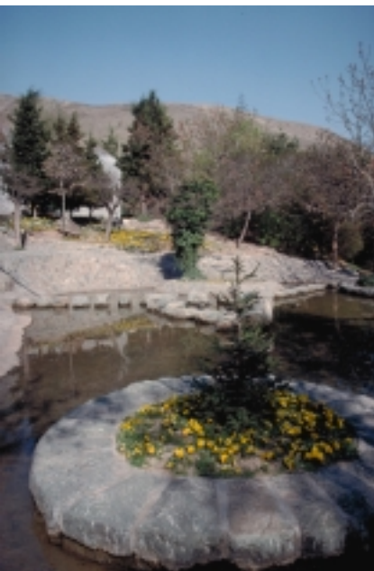
LANDSCAPING OF THE PARK WAS DESIGNED AROUND THE THEME OF STONE.

gatehouse at the main entrance at the southeast corner. Toilets are located below ground level in three of the buildings (restaurant, administration, and children's library).