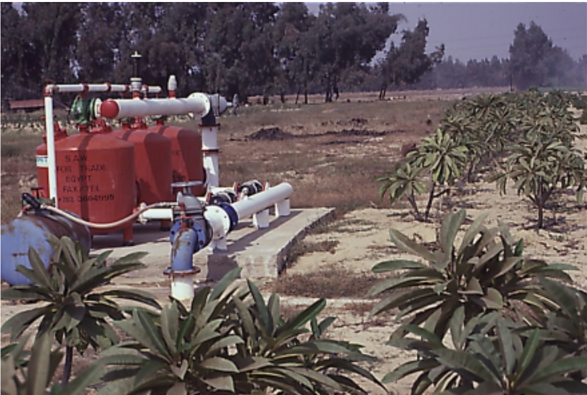
IRRIGATION METHODS CAN RANGE FROM THIS PUMP/FILTRATION STATION AT THE DESERT PLANT NURSERY OF AL- AZHAR PARK IN CAIRO TO WATERING PLANTS BY HAND FROM ROPE-AND-BUCKET WELLS.

and practical trial and error. Yet it was for a long time worrying to note how far the techniques developed by farmers and the project differed from the standard practices in the literature. Communities, groups, and households preferred to implement specific priority projects to protect valued sites. These projects could not ignore the basic physical principles of sand dune stabilisation if they were to succeed, and thus did not diverge greatly from the more pragmatic examples given in the literature. But the apparently piecemeal progress of the work and its relatively short-term aims continued to attract expert criticism.