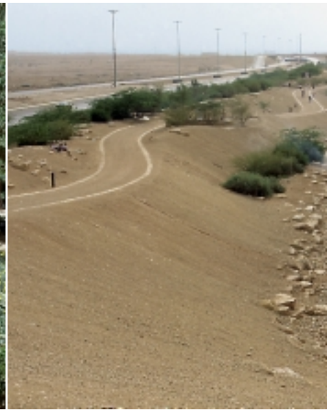
LEFT: FORMAL SHADED WALKWAYS LEAD THROUGH THE PARK OF THE DIPLOMATIC QUARTER. MIDDLE: PLANTING OF NATIVE SPECIES ALONG THE ROADSIDE AROUND THE SITE IMPROVES THE DESERT LANDSCAPING. RIGHT: FORMAL GARDEN AREAS SURROUND TUWAIQ PALACE.

The main types of green and open space developed were: