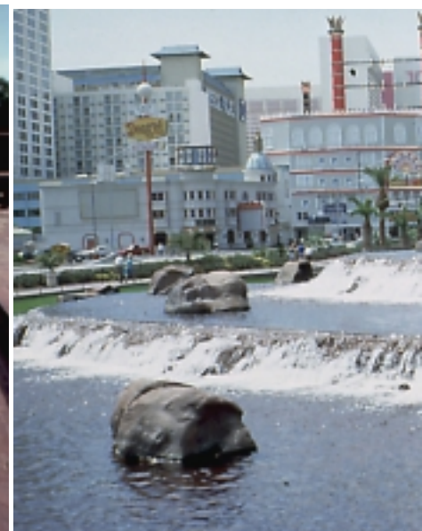
LEFT: ANUP TALO POOL AT FATEHPUR SIKIRI, INDIA, THE ELEGANT MUGHAL CAPITAL (1571-1585) ABANDONED IN PART DUE TO ITS POOR WATER SUPPLY PROBLEMS. MIDDLE: EXTRAVAGANT WATER DISPLAYS IN LAS VEGAS, NEVADA, USA. RIGHT: ABANDONED FORT, SAINI, EGYPT.

ages be forged between landscape design and international environmental policy.