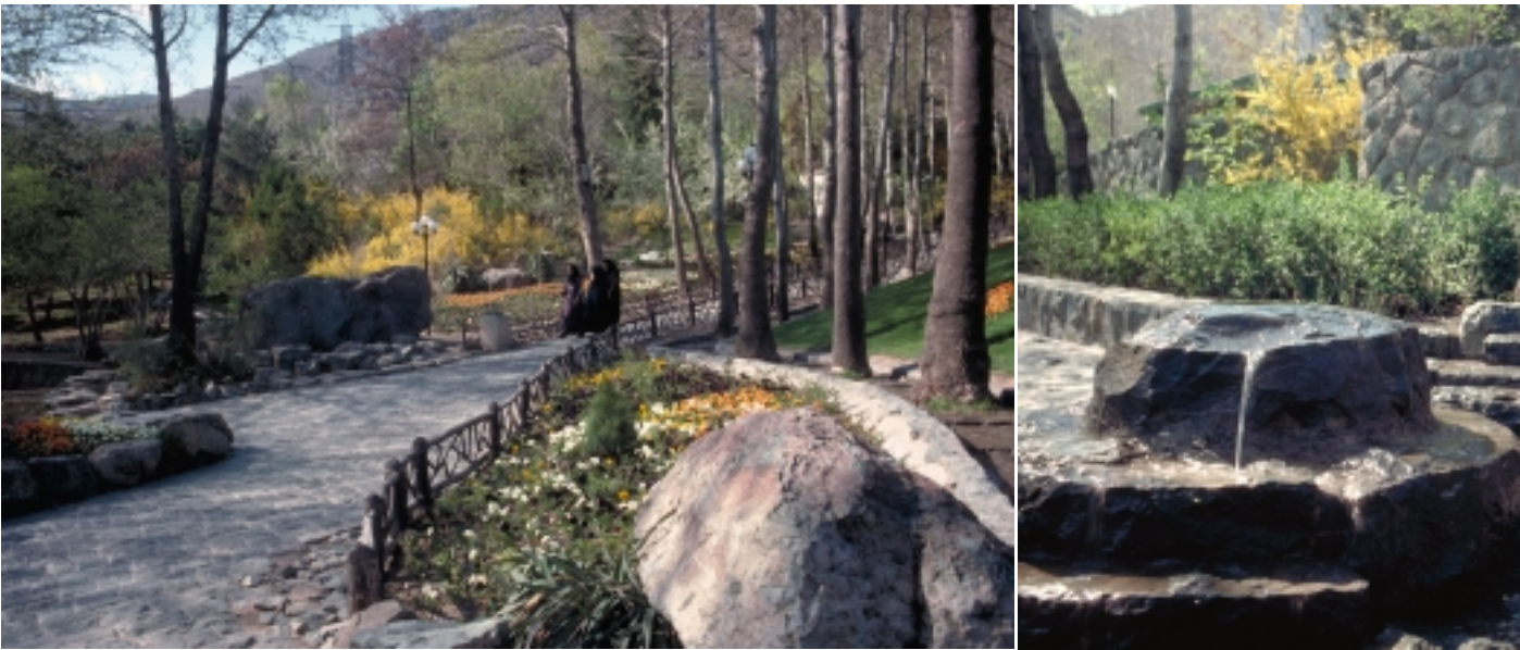
LEFT TO RIGHT: VIEWS OF THE BAGH SANGI JASHIDIEH PARK, LOCATED AT THE NORTHERN EDGE OF TEHRAN. FORMERLY A FRUIT ORCHARD, TRANSFORMED INTO A PUBLIC GARDEN.